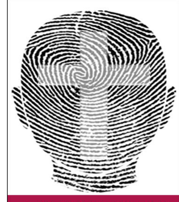
A NEW IDENTITY

©Divine Literature International 2015-2023